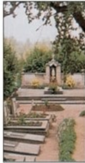
The common tomb at the far end of the Sisters of Our Lady of Mercy cemetery in Cracow-Lagiewniki, where St. Faustina's mortal remains were first laid to rest on October 7, 1938.