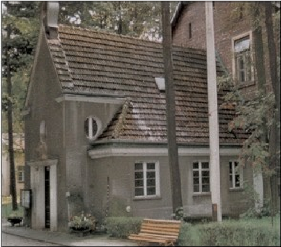
The chapel of the Prądnik Sanatorium in Cracow where St. Faustina prayed as she received treatment in the sanatorium for her illness.