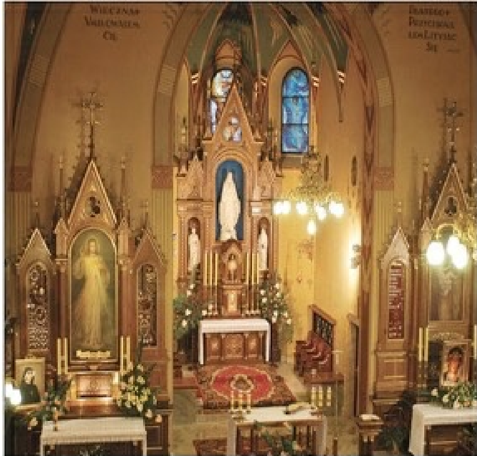
The sanctuary of the the chapel of the Congregation of the Sisters of Our Lady of Mercy in Cracow-Łagiewniki, where Saint Faustina spent her novitiate and last years of her life.