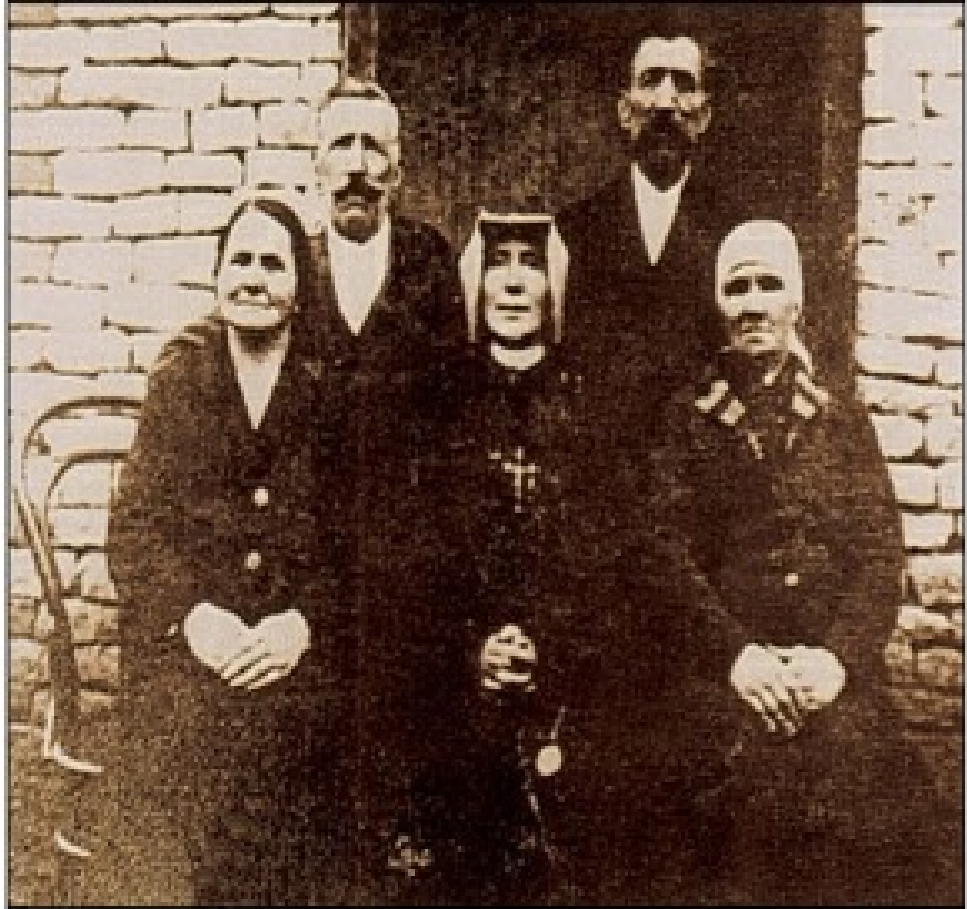
St. Faustina during the sole visit she made to her family during her convent life. On the right, her parents; on the left, her godparents.