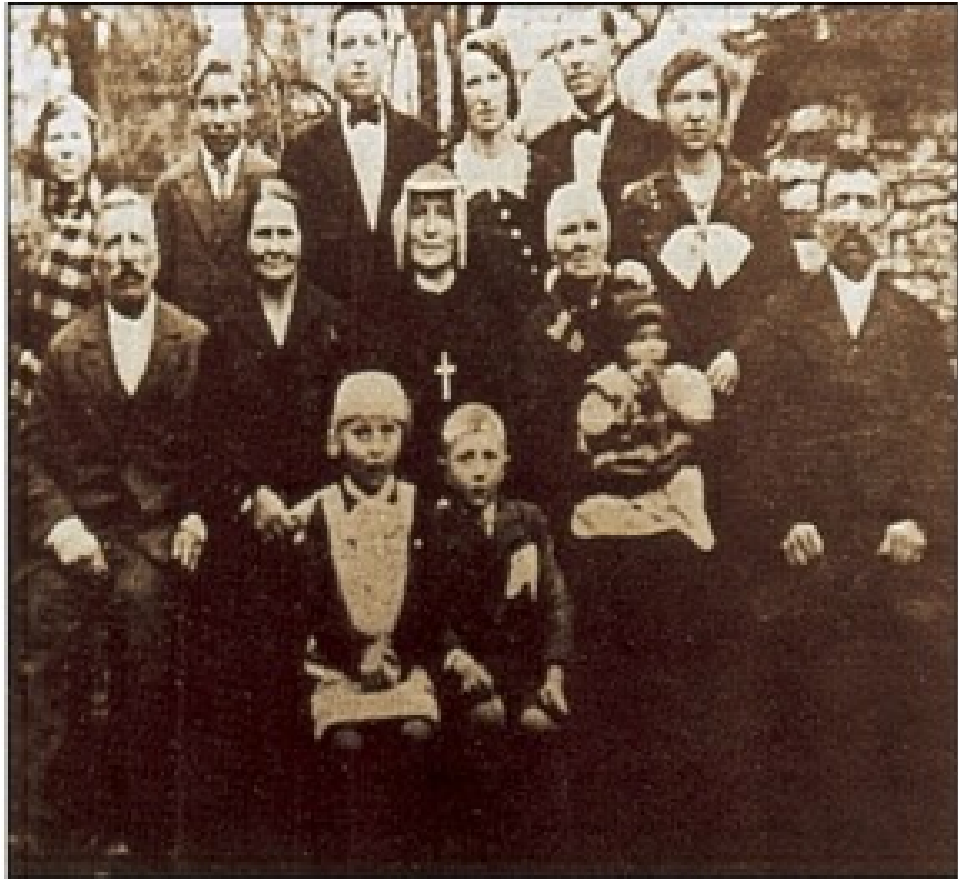
St. Faustina with her immediate family and godparents.