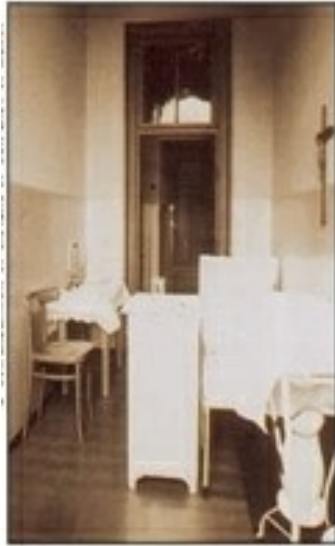
The cell in the infirmary of the convent in Cracow-Lagiewniki where St. Faustina died on October 5, 1938.