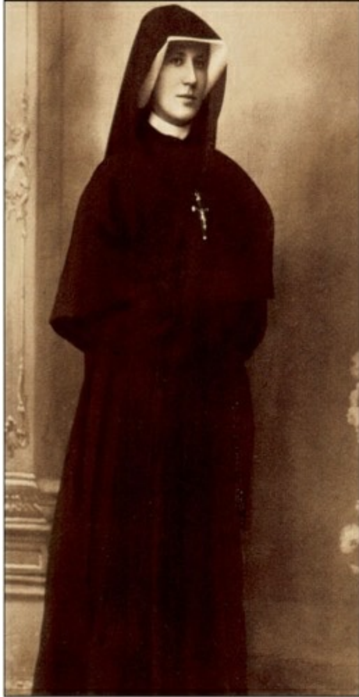
Saint Maria Faustina Kowalska of the Congregation of Sisters of Our Lady of Mercy (1905-1938). The photograph was taken in Plock in 1929.