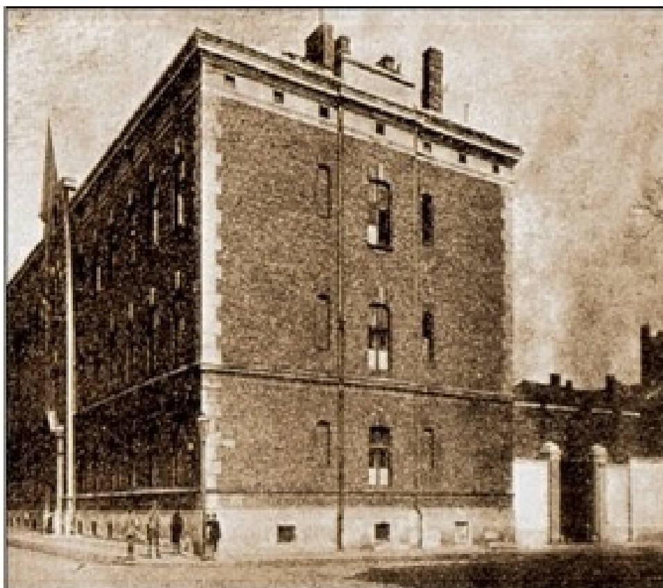
Mother House of the Congregation of Sisters of Our Lady of Mercy on 3/9 Żytnia Street, Warsaw, Poland, where St. Faustina entered the convent. This building was completely destroyed during World War II and a new one was built after the war.