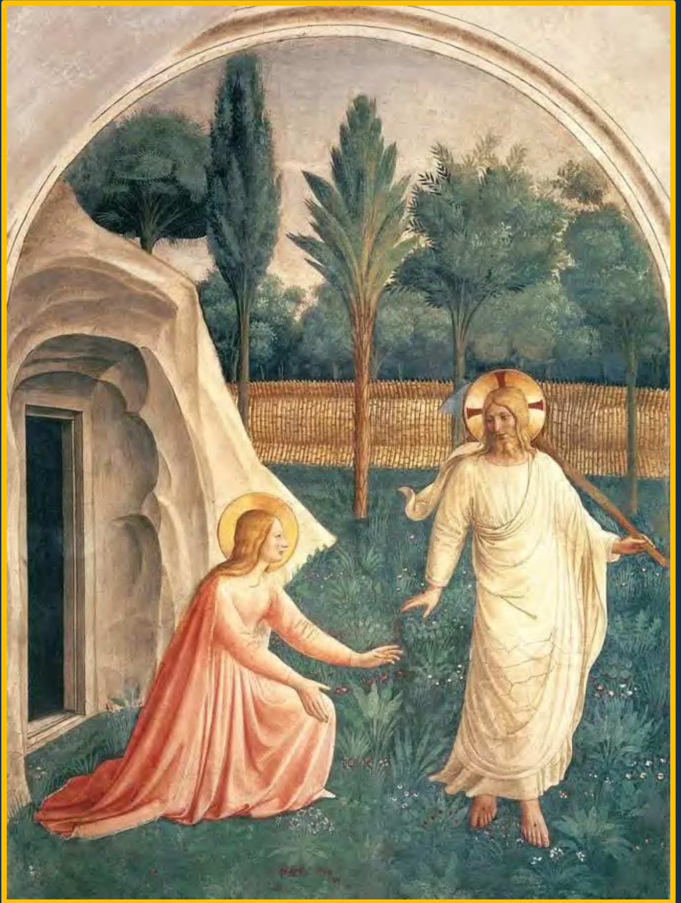
Nolo Me Tangere ( “Do not touch Me” )