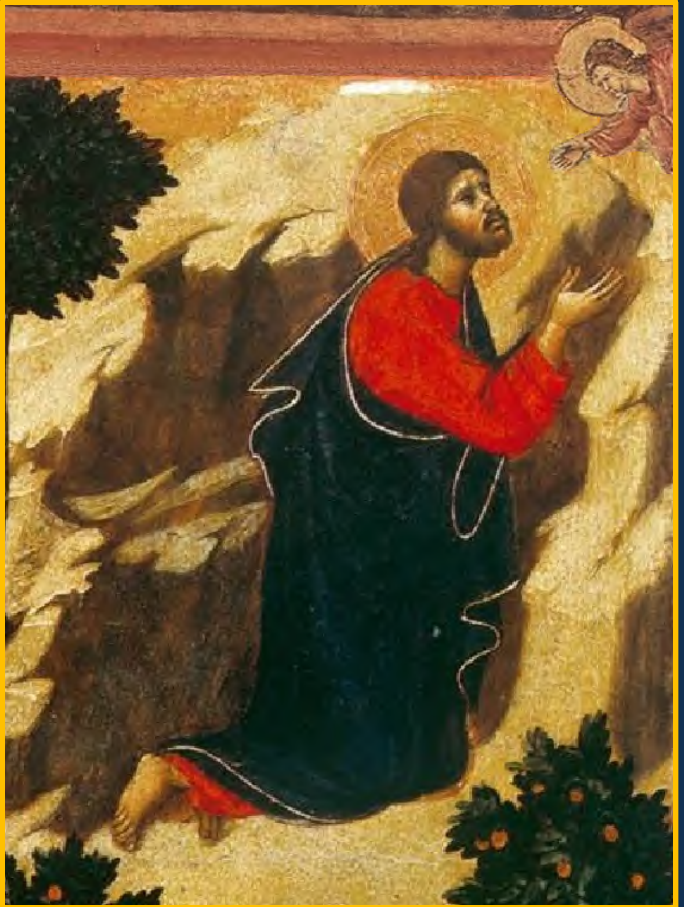
The Agony in the Garden