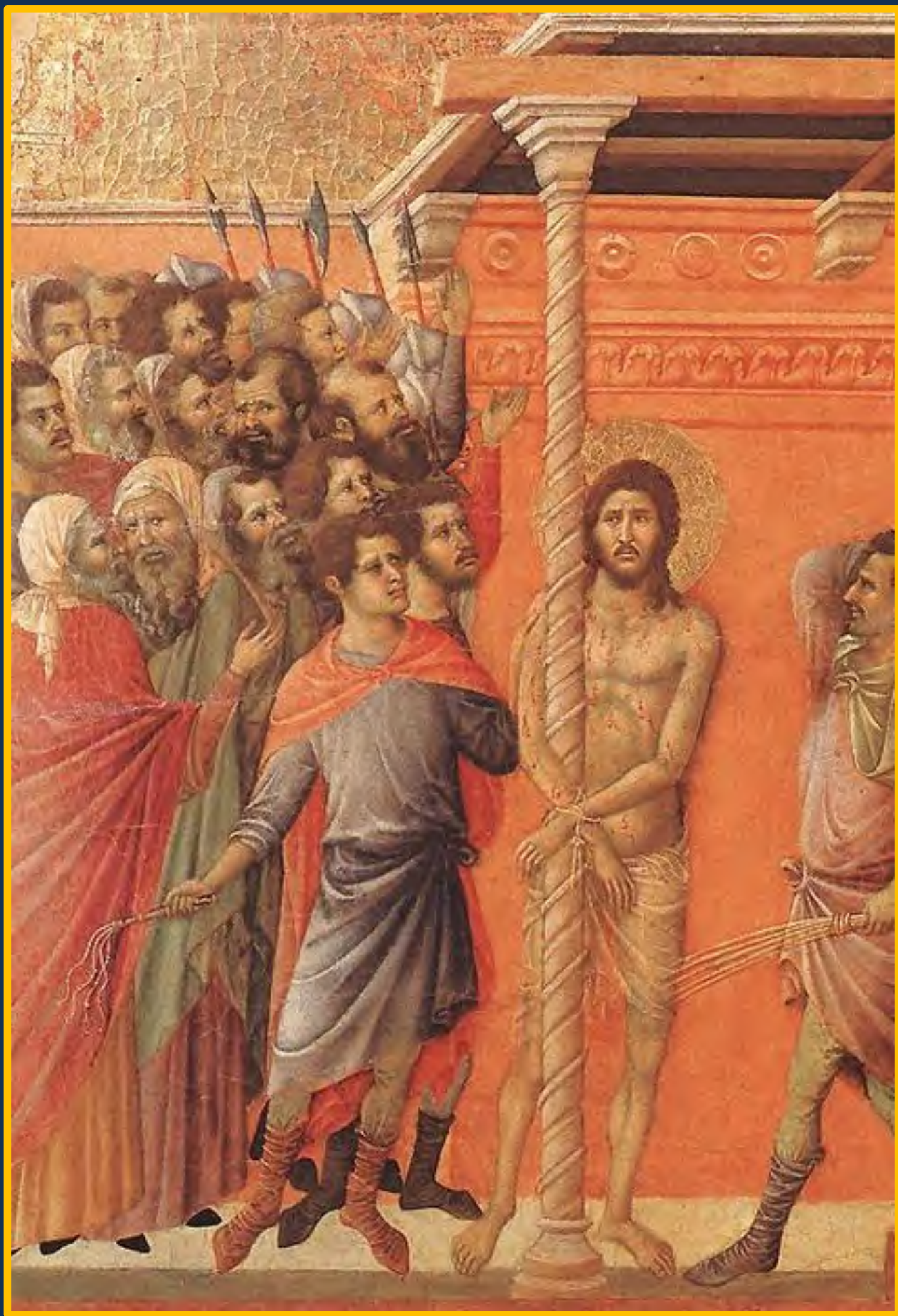
The Scourging at the Pillar