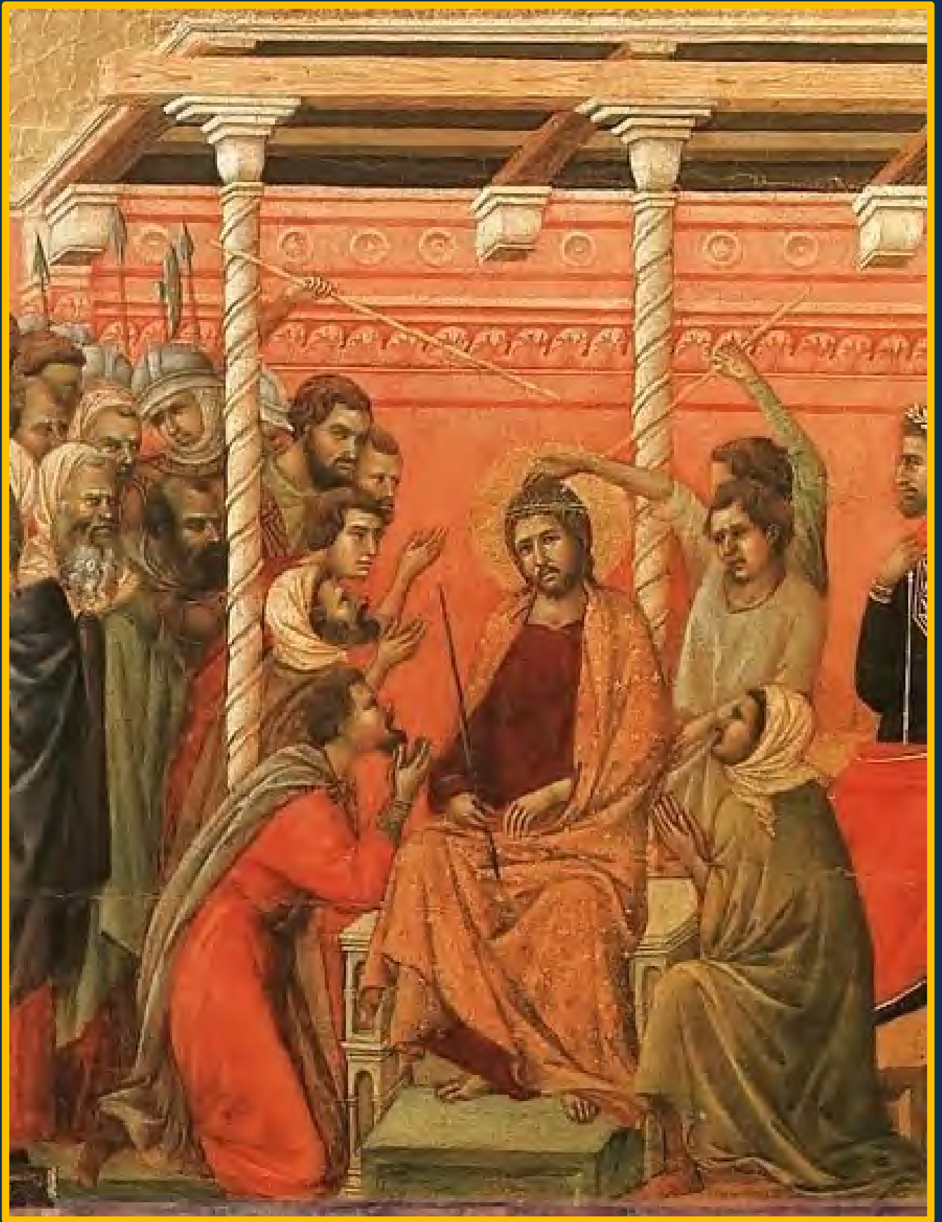
The Crown of Thorns