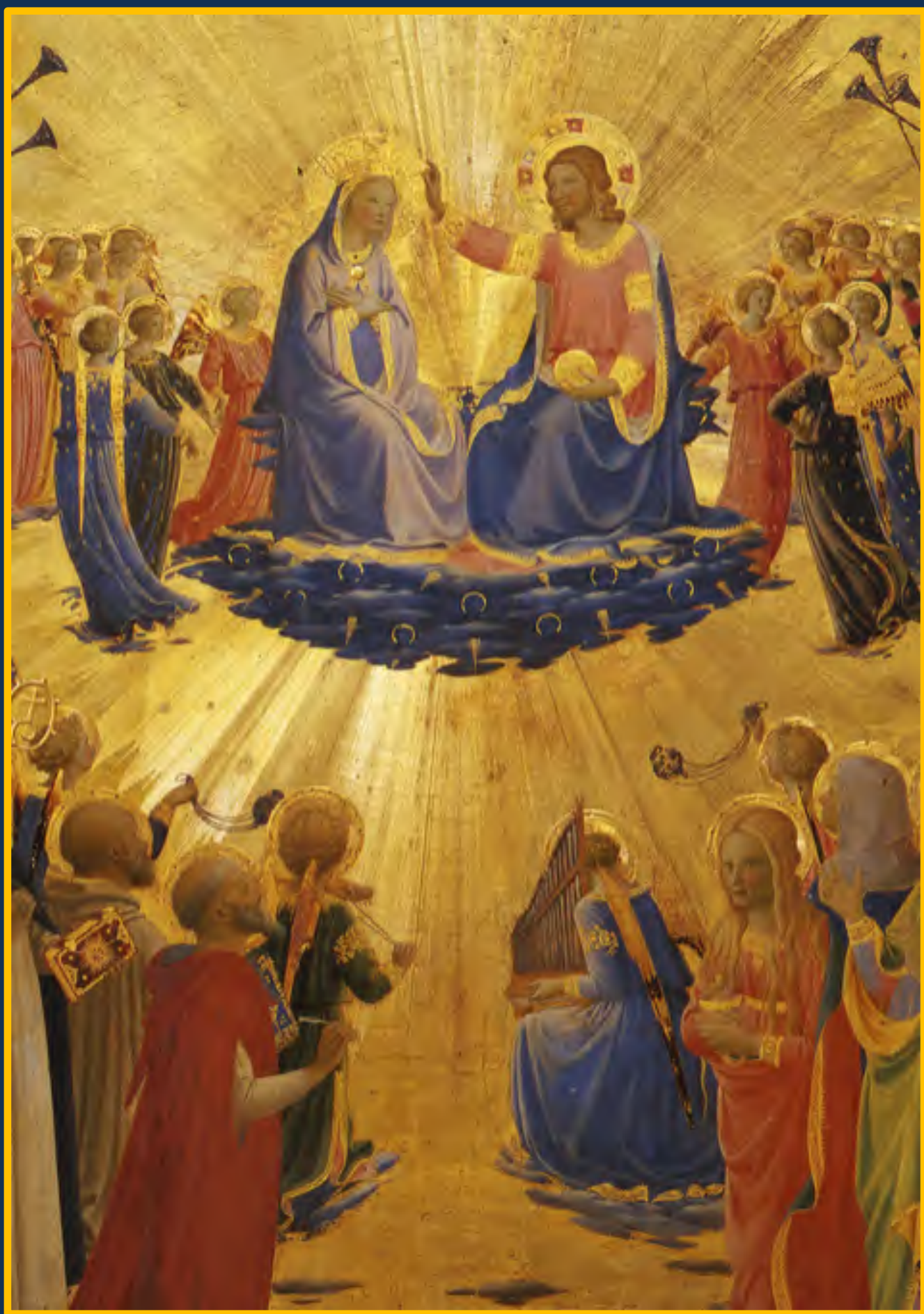
Coronation of the Blessed Virgin