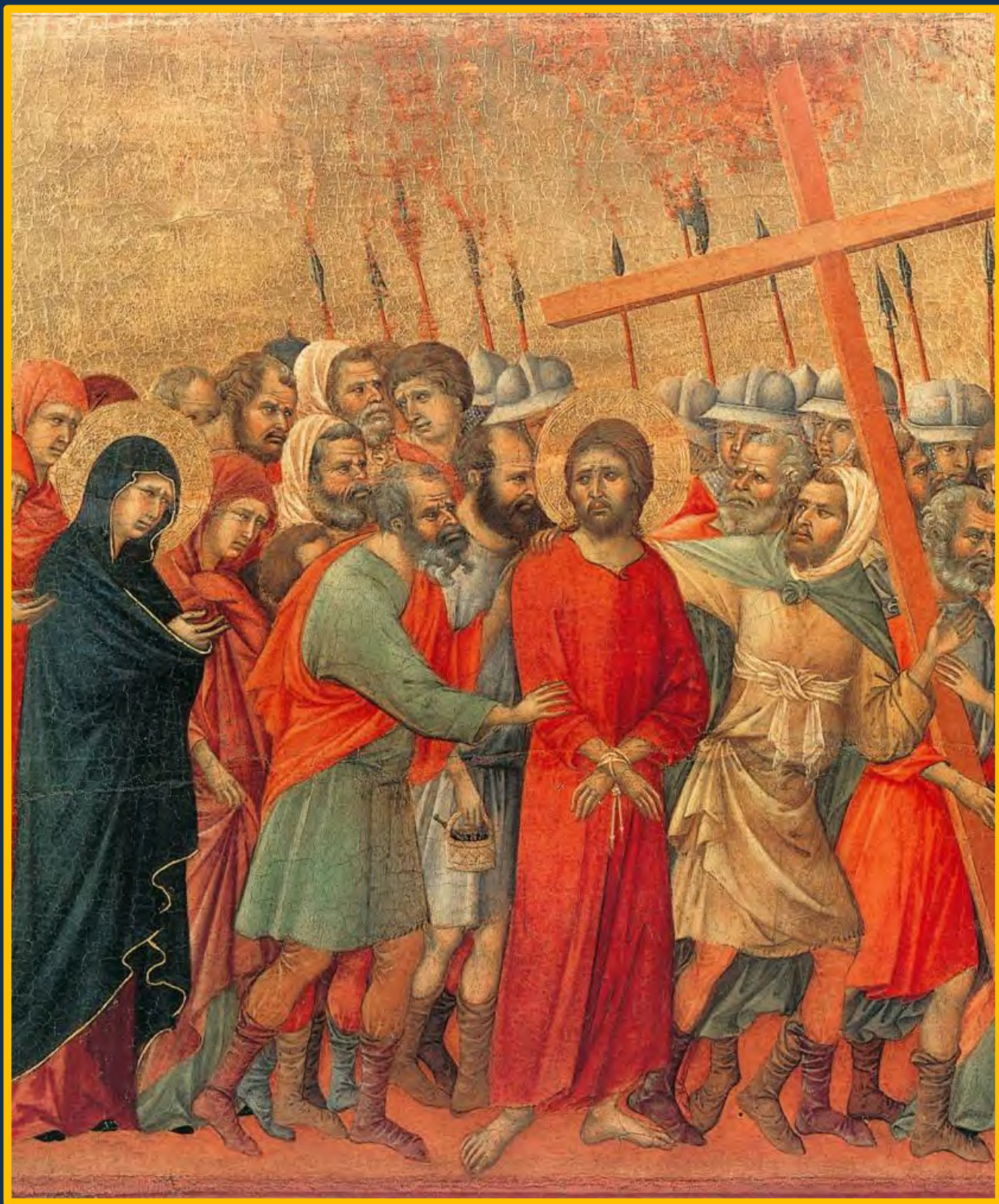
The Way to Calvary