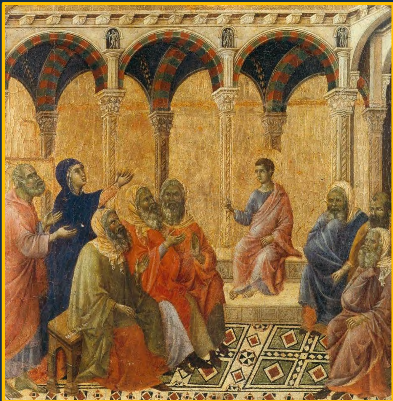
The Finding of the Child Jesus in the Temple