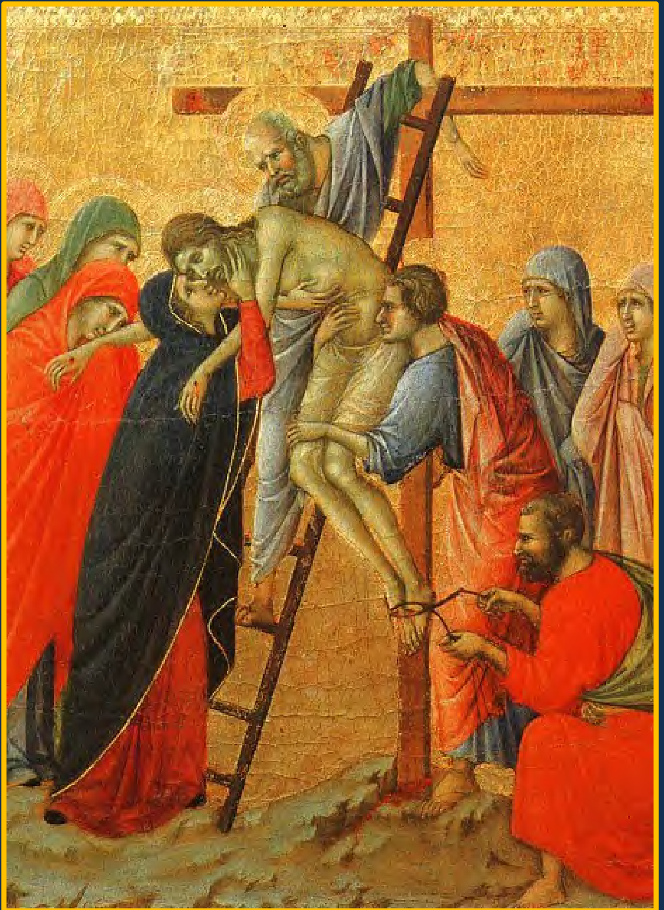
Taking Jesus down from the Cross