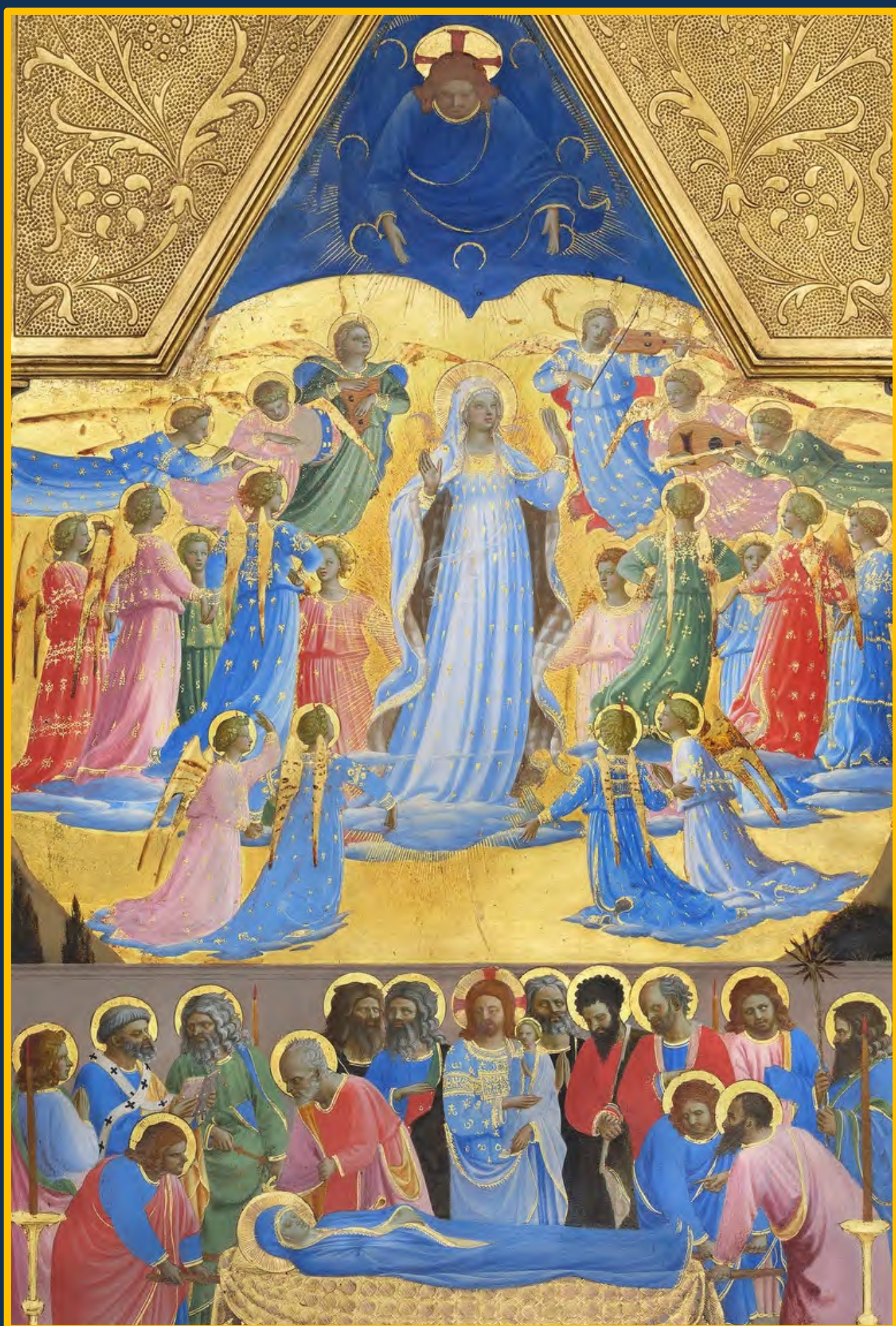
Dormition and Assumption of the Blessed Virgin