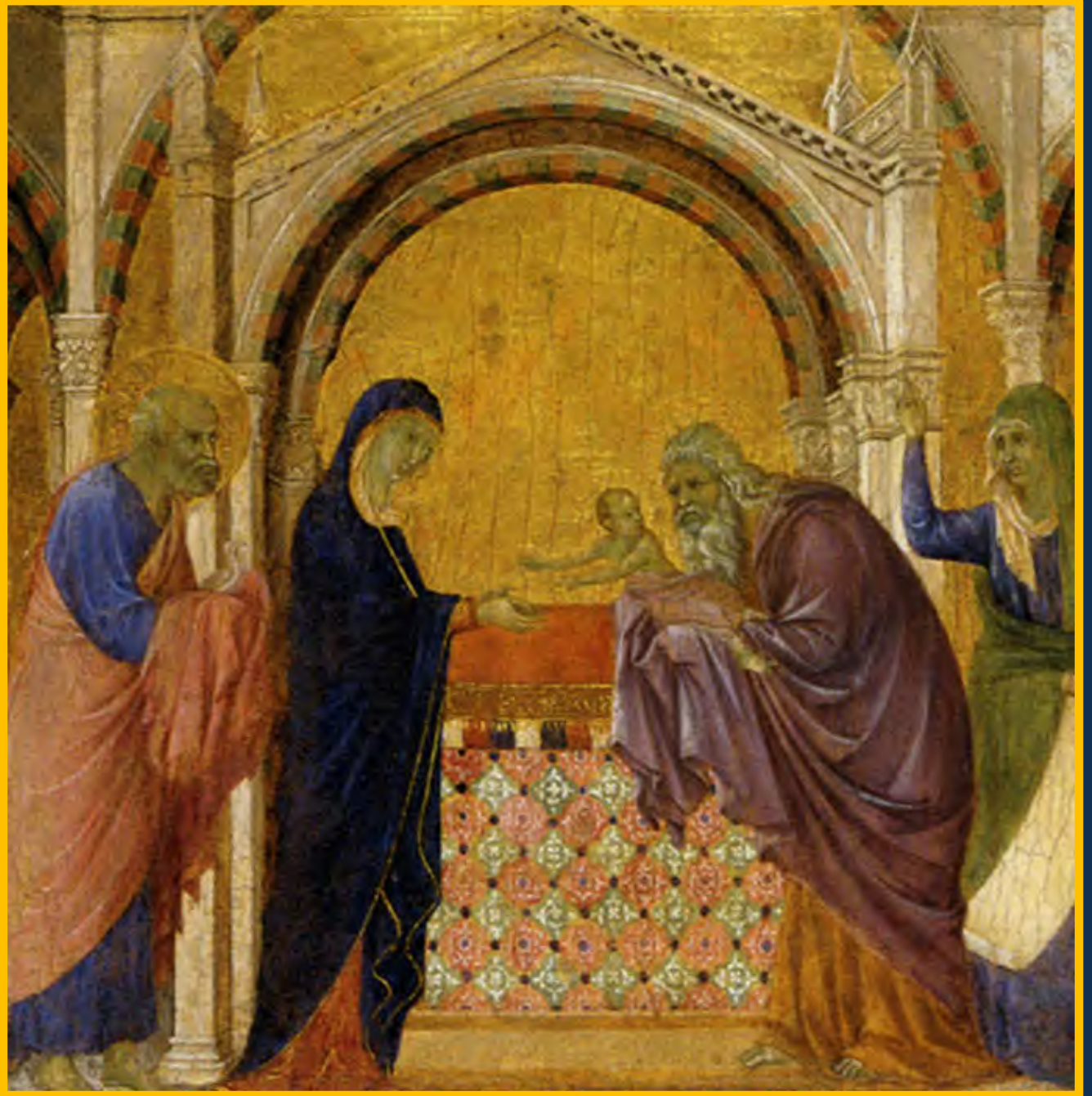
The Presentation in the Temple