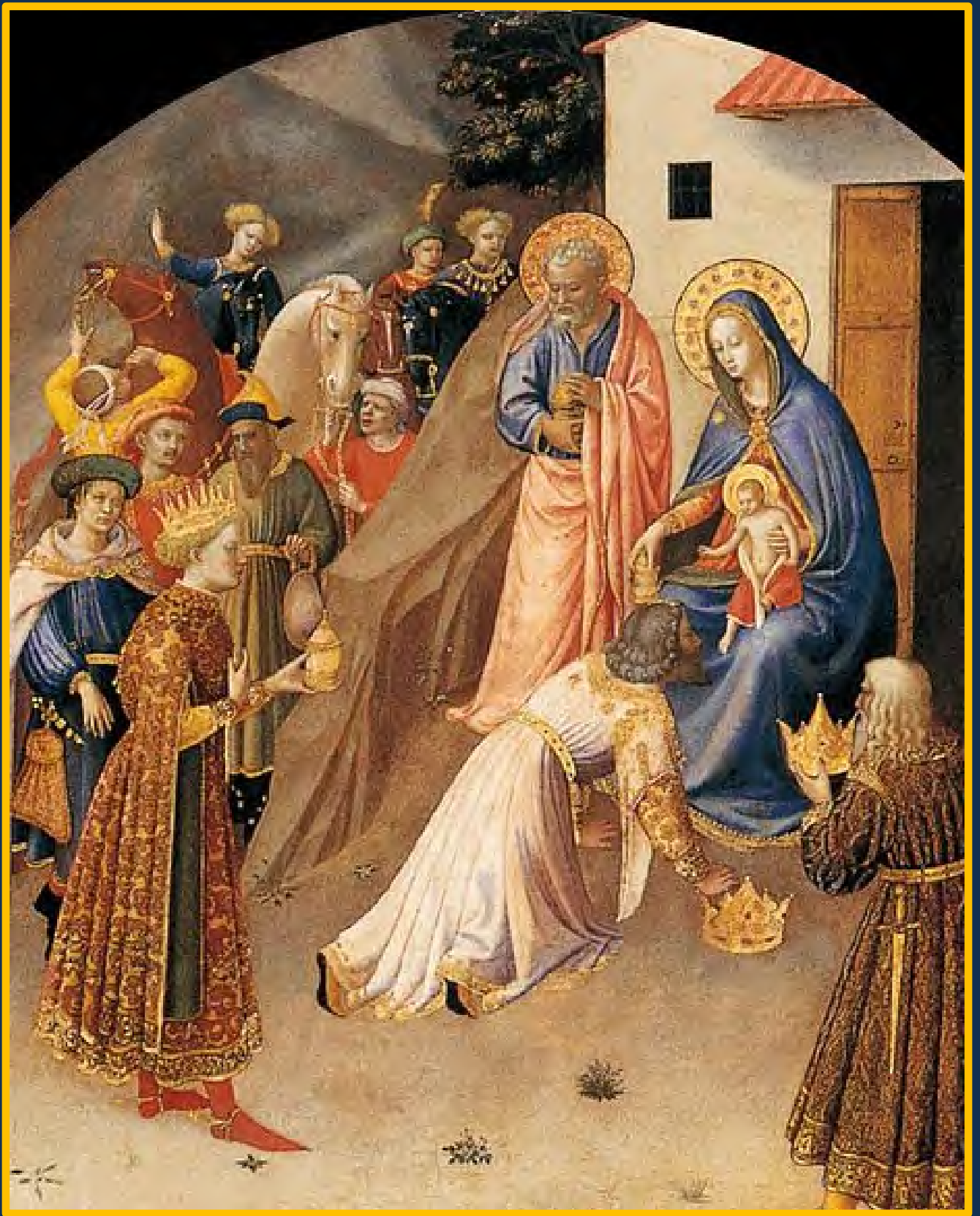
Adoration by the Magi