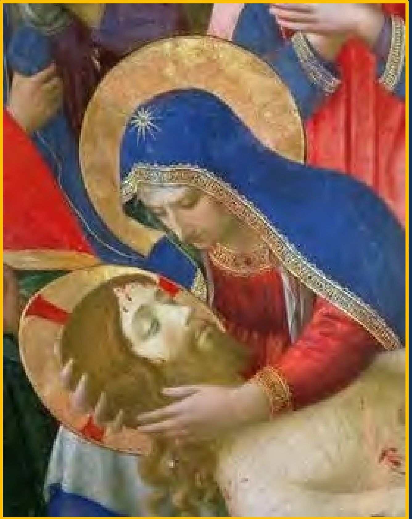
Lamentation over Christ